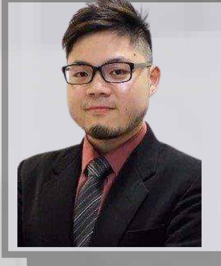
Partner, Messrs Ram & Low Topic: Analysis Of Recent Medico Legal Judgements